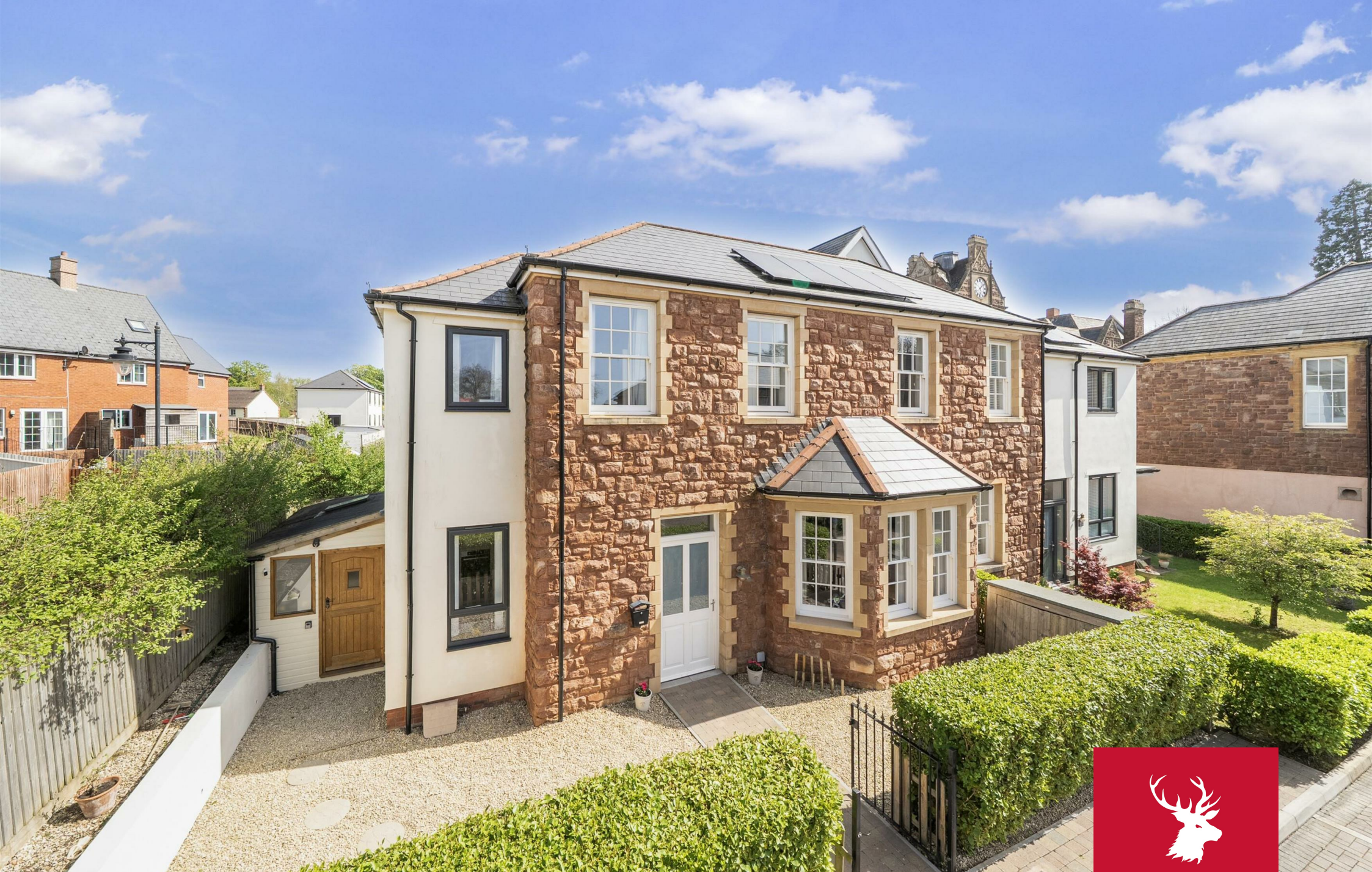
1 Lodge House