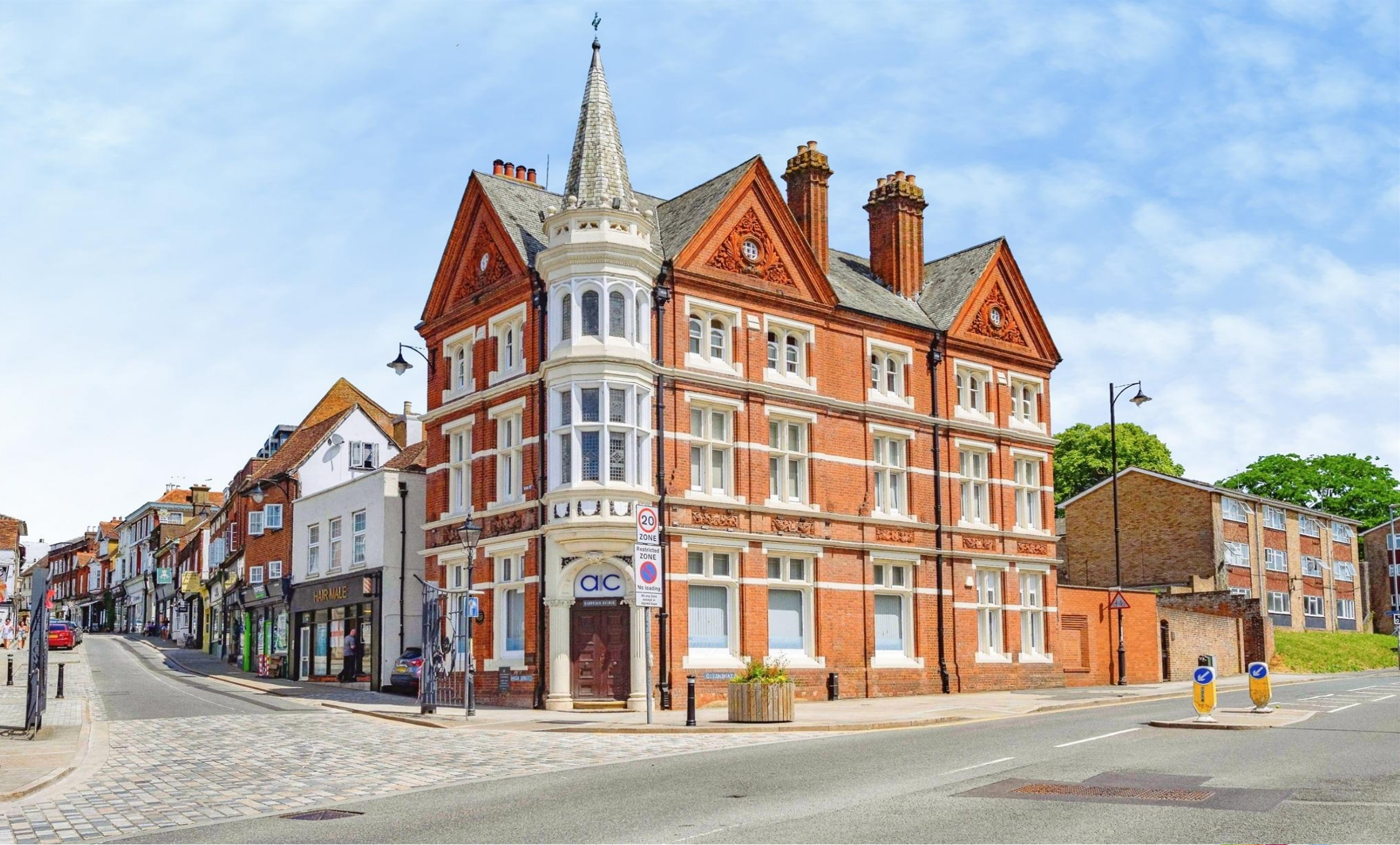
High Street, Hemel Hempstead HP1 3AA