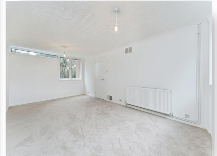
Clare Close, Mildenhall IP28 7NW