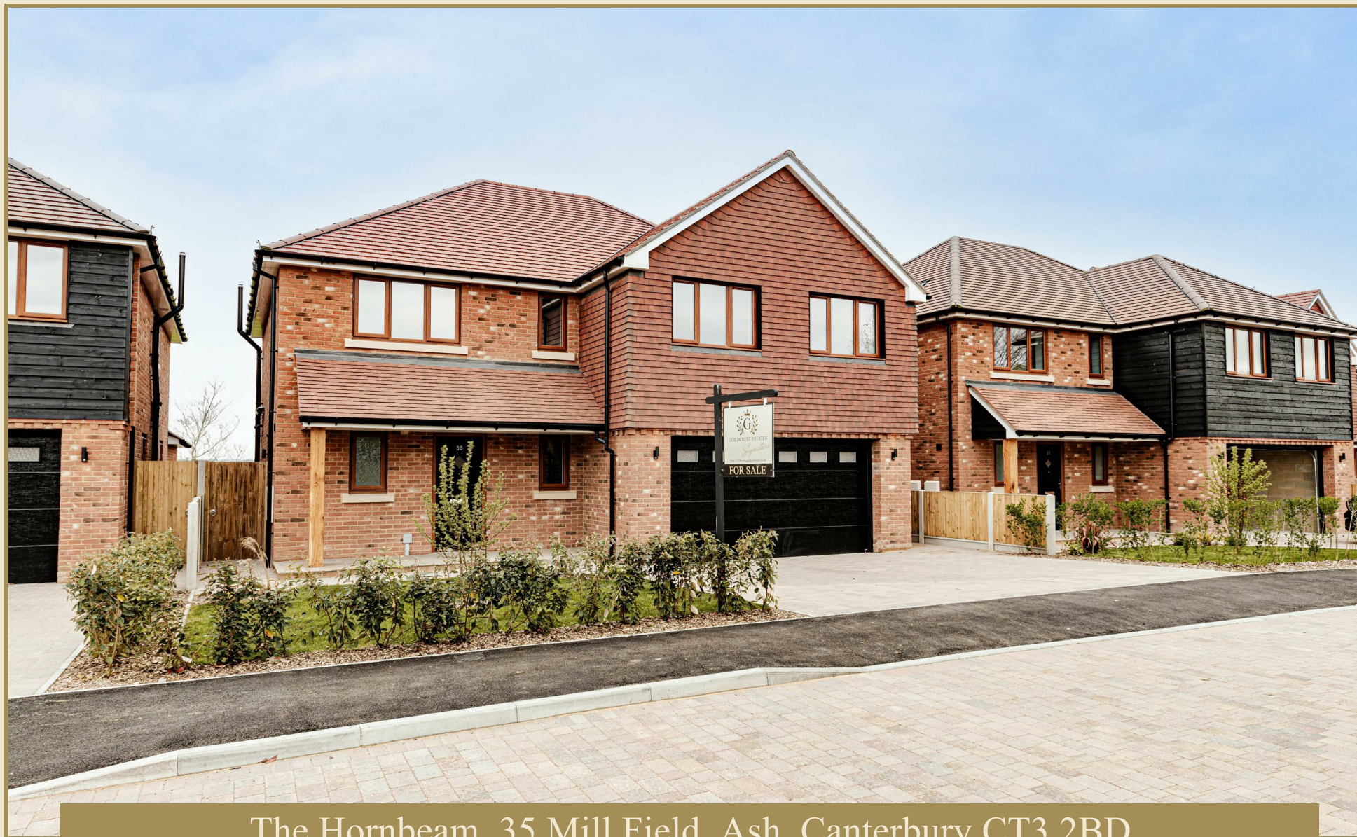
The Hornbeam, 35 Mill Field, Ash, Canterbury CT3 2BD