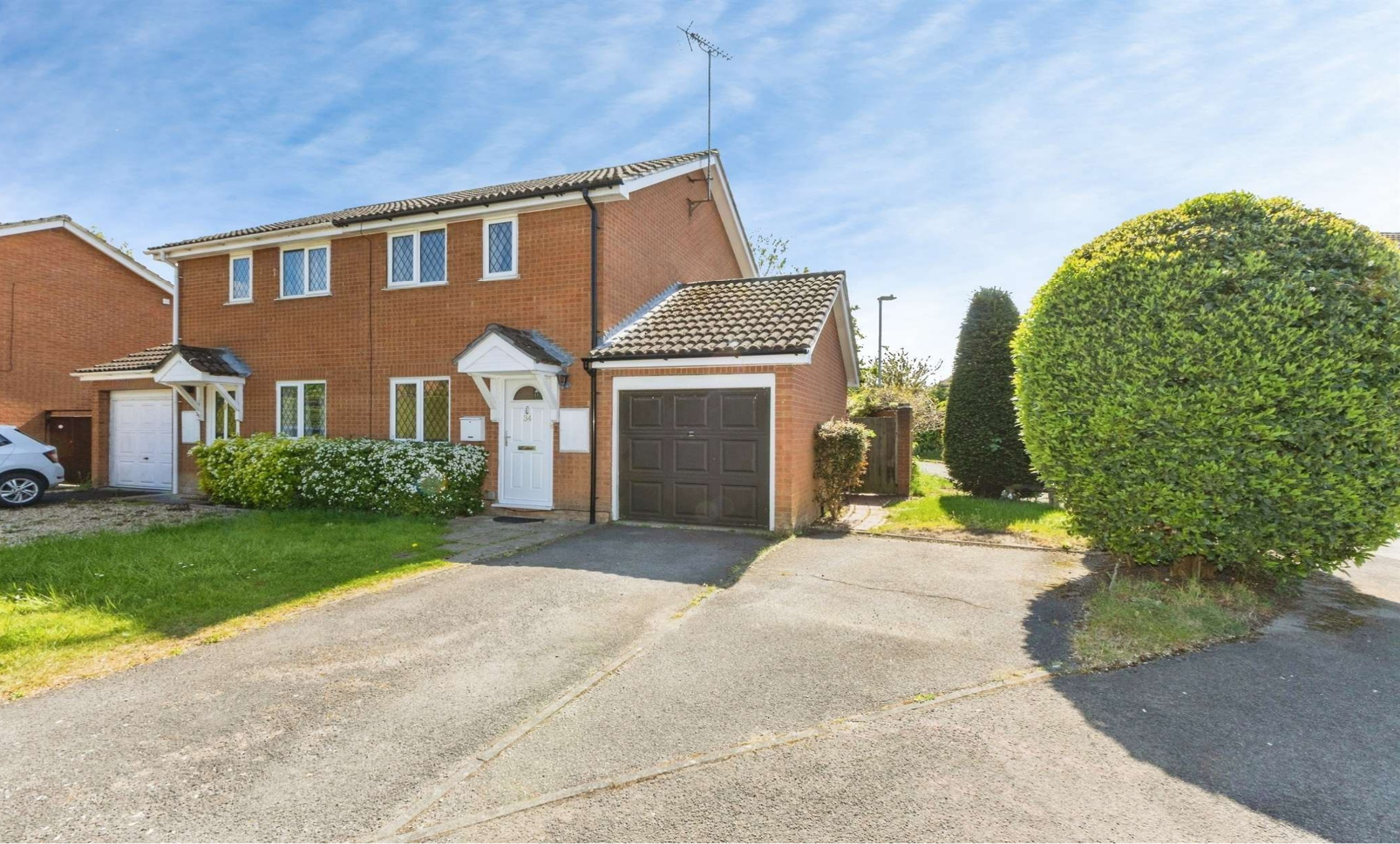
Doddington Close, Lower Earley Reading RG6 4BJ