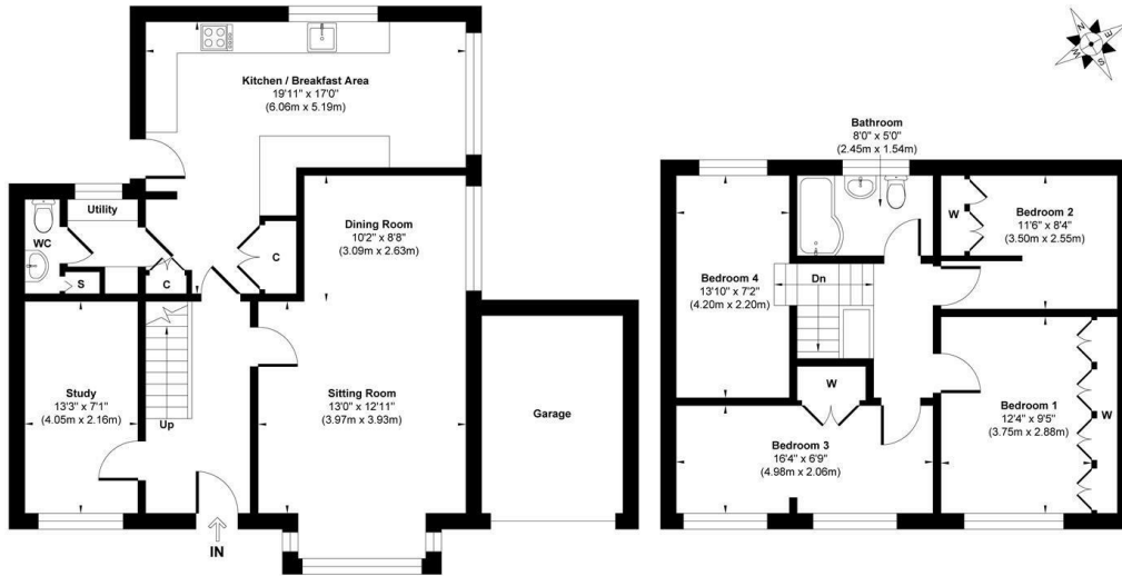
Ground Floor Approximate Floor Area 719 sq.ft (66.76 sq.m)

Situated just 4 miles east of Newcastle upon Tyne, Wallsend is a well-established town with a rich Roman heritage, marking the eastern end of Hadrian's Wall. It offers a strong sense of community alongside modern amenities, making it attractive to families, professionals and investors. The area features a range of local shops, cafes and leisure facilities, as well as green spaces such as Richardson Dees Park and the Wagonways. Wallsend is well served by schools and benefits from excellent transport links, including the Metro and nearby road routes.