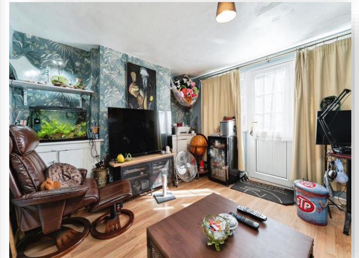
The Wroe, Emneth, WISBECH, PE14 8AL