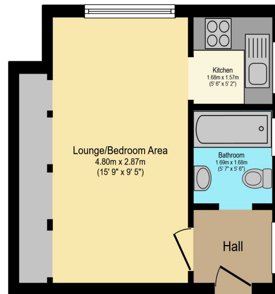
Floor Plan Floor area 25.0 sq.m. (269 sq.ft.)

Total floor area: 25.0 sq.m. (269 sq.ft.)