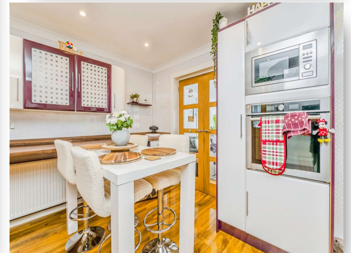
Bryncyn, Pentwyn Cardiff CF23 7BJ