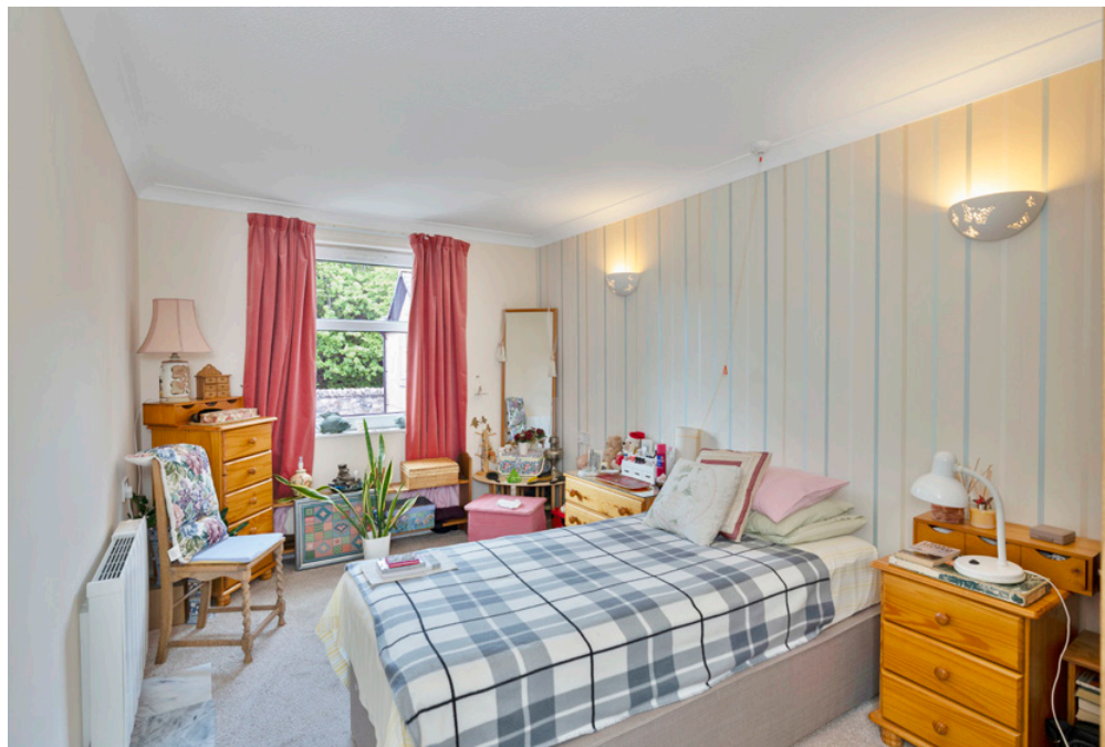
SPACIOUS, MODERN KITCHEN THAT IS WELL APPOINTED AND A LARGE DOUBLE BEDROOM