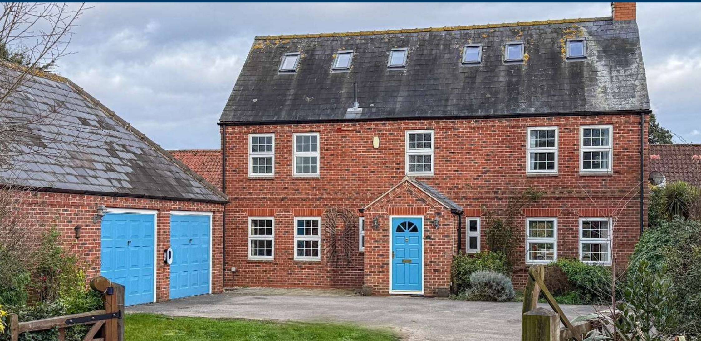
Bells Court, Carlton-le-Moorland