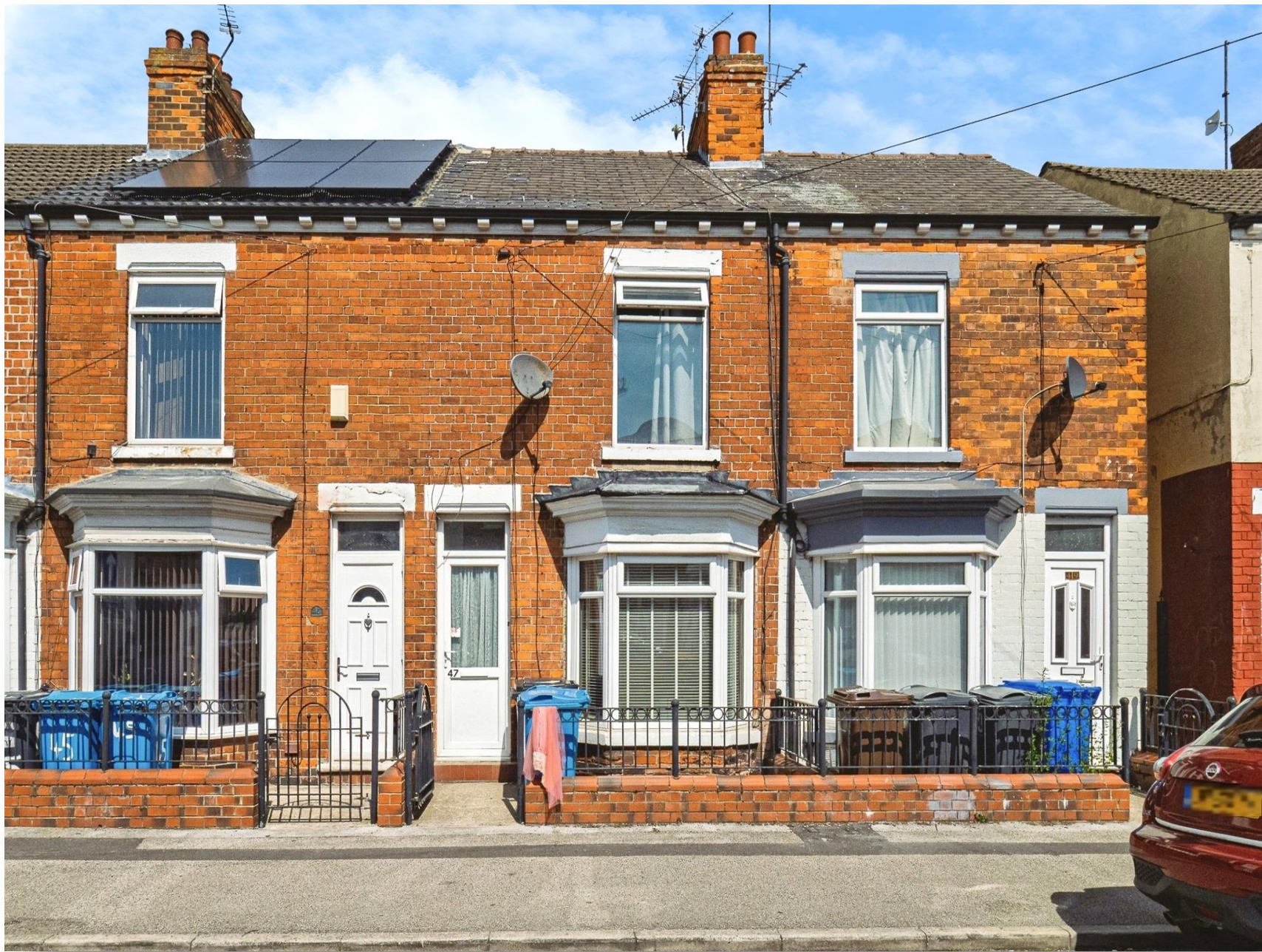
Belmont Street, Hull, HU9 2RH