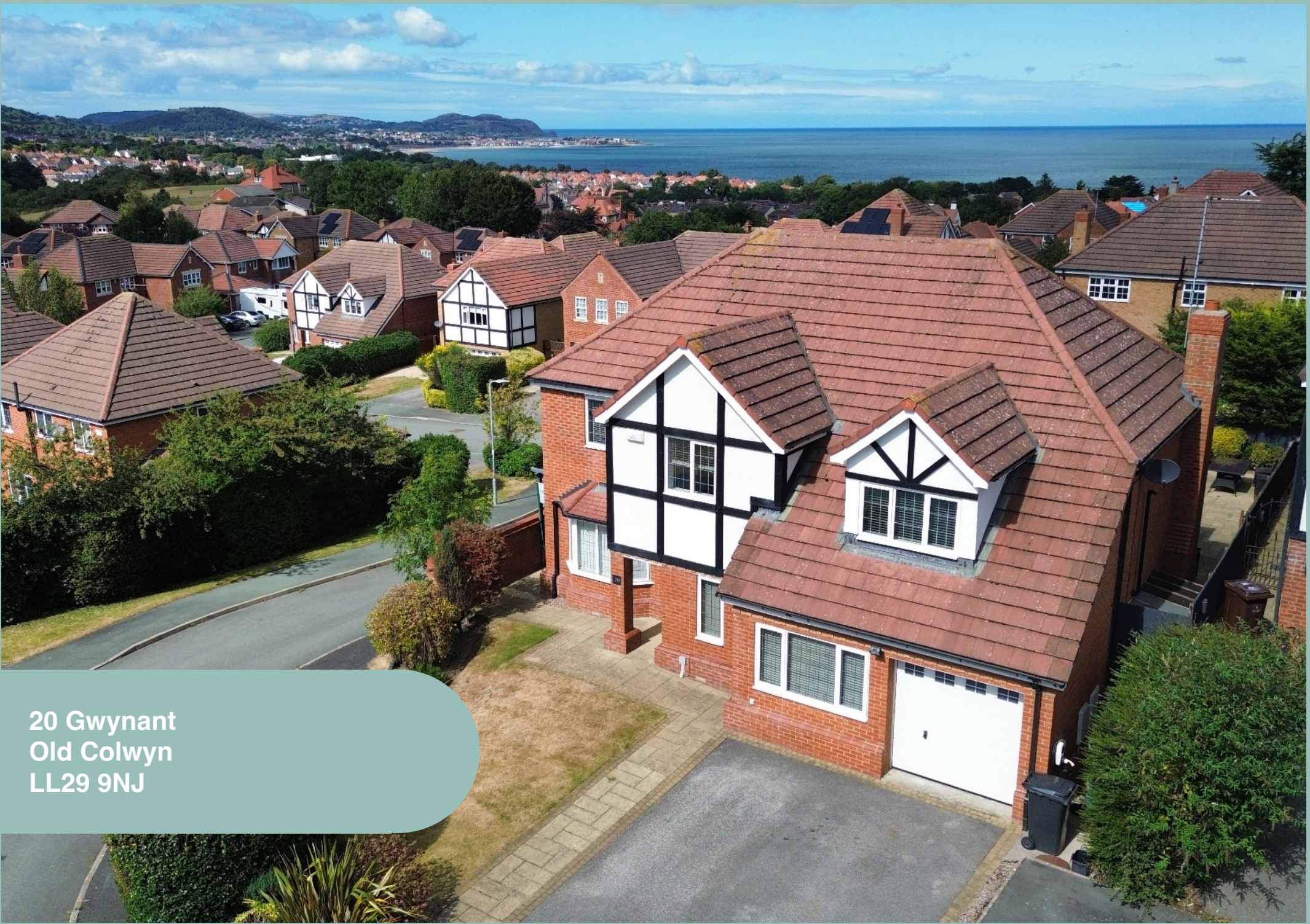
20 Gwynant Old Colwyn LL29 9NJ