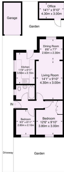
ILLUSTRATION FOR IDENTIFICATION PURPOSES ONLY ALL MEASUREMENT ARE MAXIMUM, AND INCLUDE WINDOW BAYS AND WARDROBES WHERE APPLICABLE THIS PLAN MUST NOT BE REPRODUCED BY ANY OTHER PERSON WITHOUT PERMISSION

13 Chantry Close Approximate Gross Internal Area = 52.2 sq m / 561 sq ft Store = 5 sq m / 53 sq ft Total = 57.2 sq m / 614 sq ft