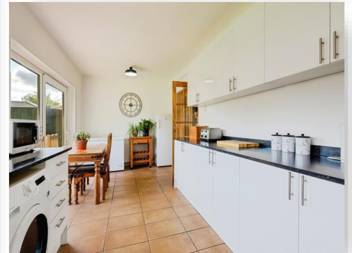
Irving Grove, Corby NN17 2BL