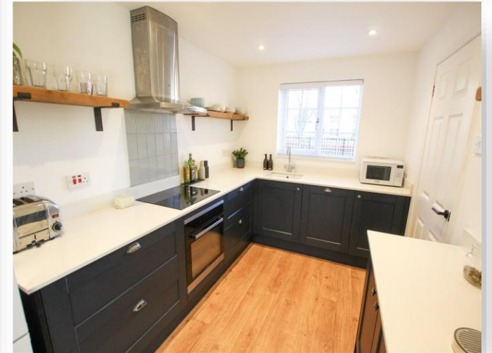
Goldfinch Drive, Cottenham, Cambridge, CB24 8XY