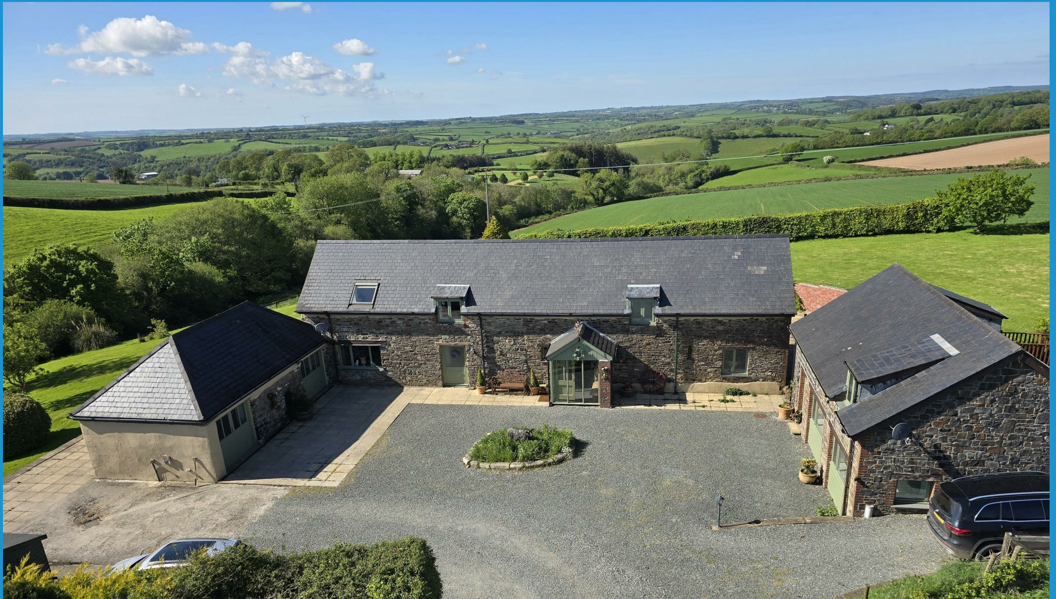
Crosstown Barn Lifton Devon