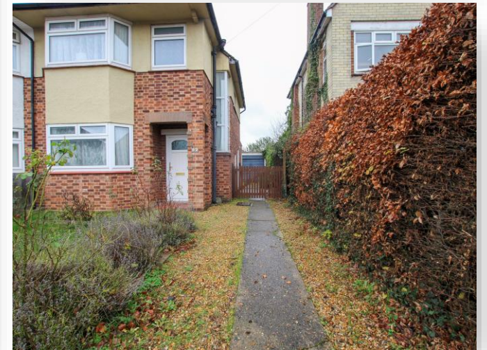
Park Avenue, Histon Cambridge, CB24 9JU