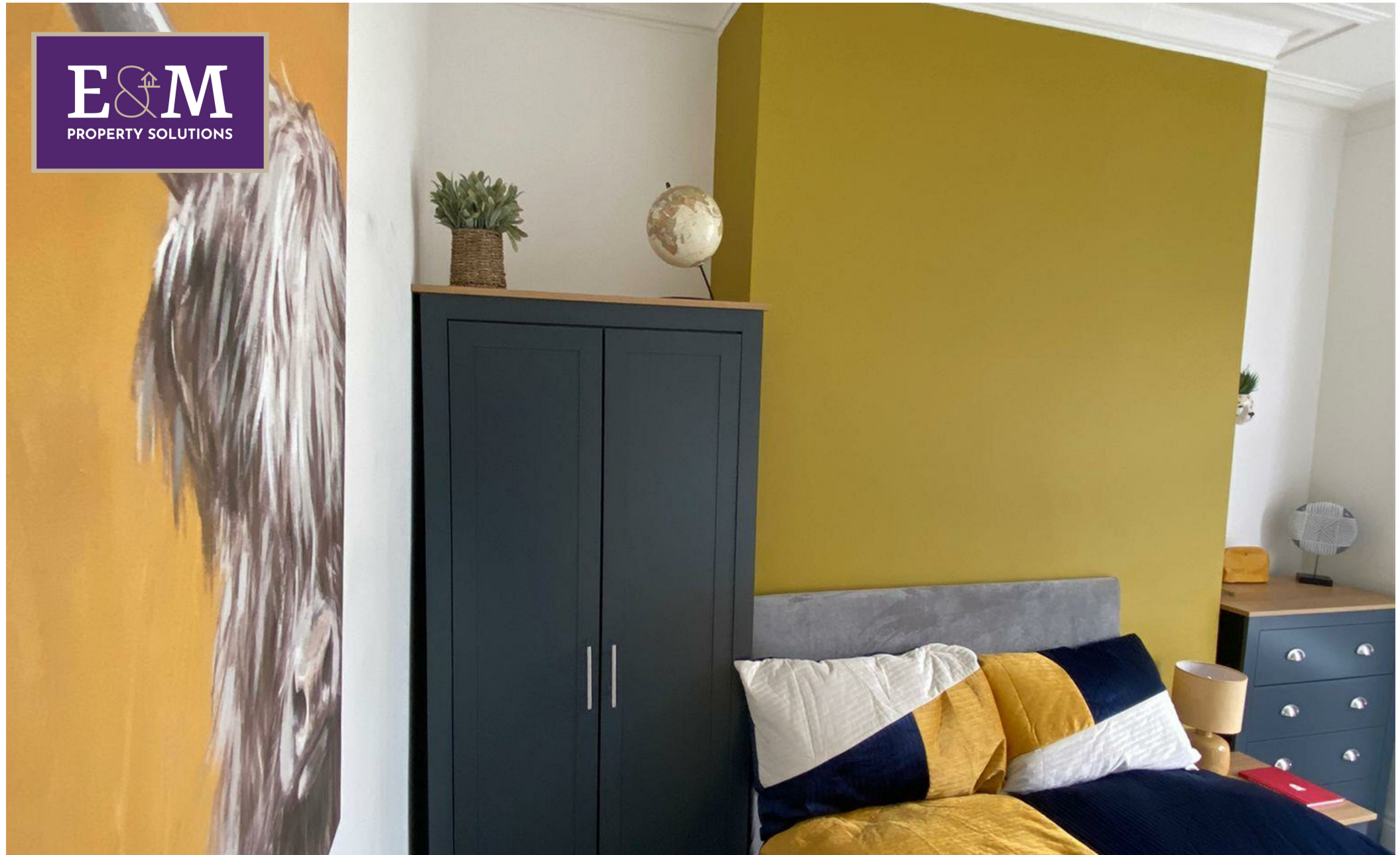
Room 1, 207 Coal Clough Lane, Burnley, Lancashire, BB11 4DL £100 Per week