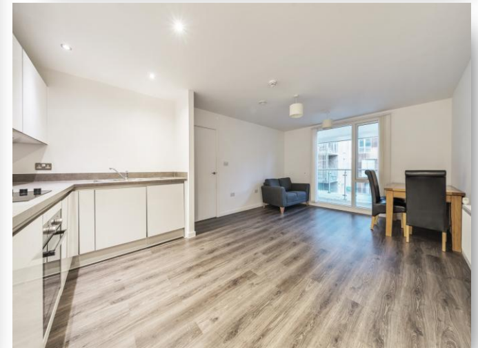
Flat 9 Trent House, 5 Kidwells Close, Maidenhead SL6 8FU