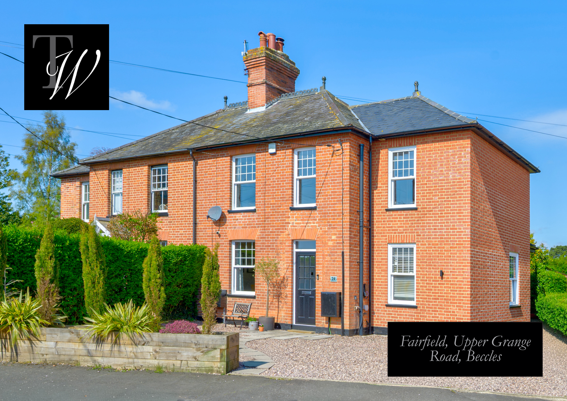
Fairfield, Upper Grange Road, Beccles