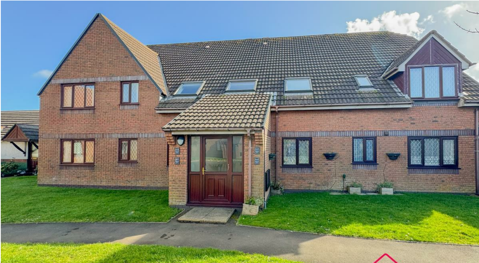
20 Magnus Court, Kings Reach, Ramsey, IM8 3NT Asking Price £197,500