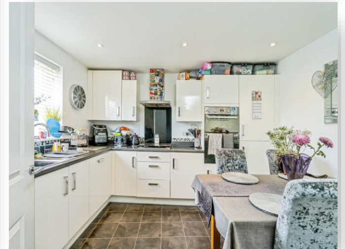
Meaden Way, Felpham Bognor Regis PO22 8FA