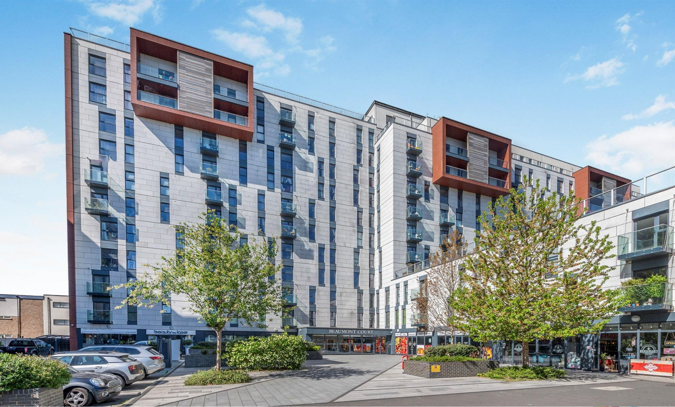
Beaumont Court, Victoria Avenue, Southend-On-Sea SS2 6BX