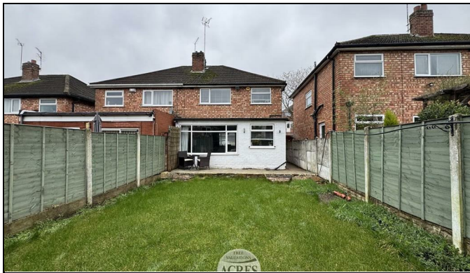
Gorse Farm Road, Great Barr, B43 5LP