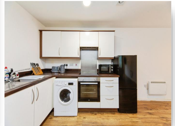
St. Johns House Robinson Road, Ellesmere Port CH65 5FH