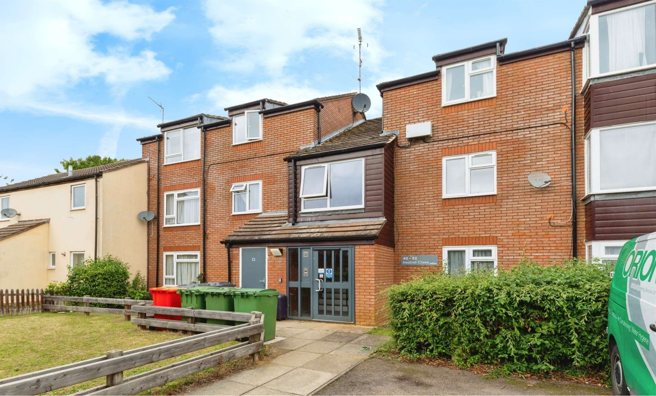
Kestrel Close, Stevenage, SG2 9PB