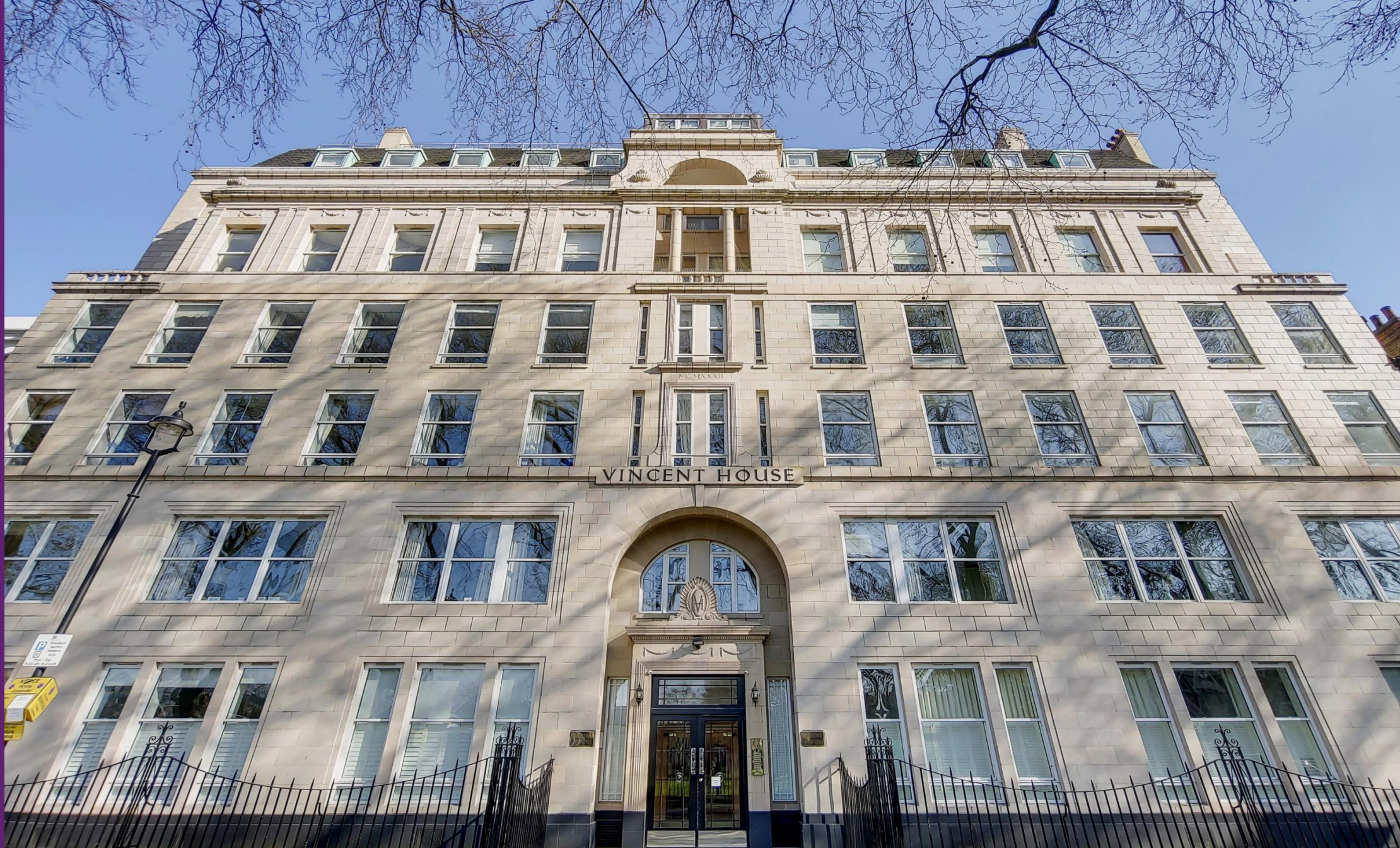
Vincent House Vincent Square, SW1P