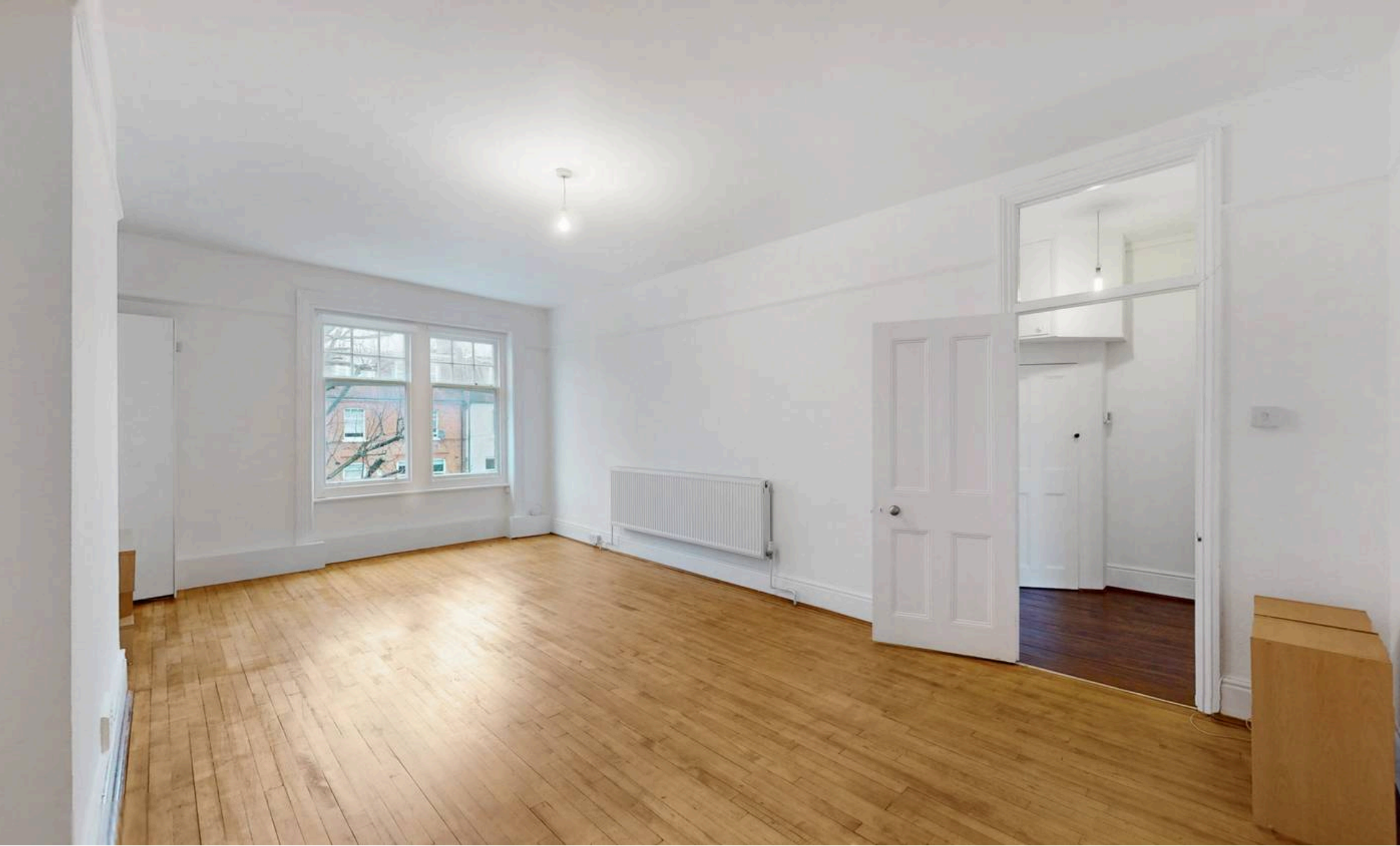
Greencroft Gardens, London, NW6