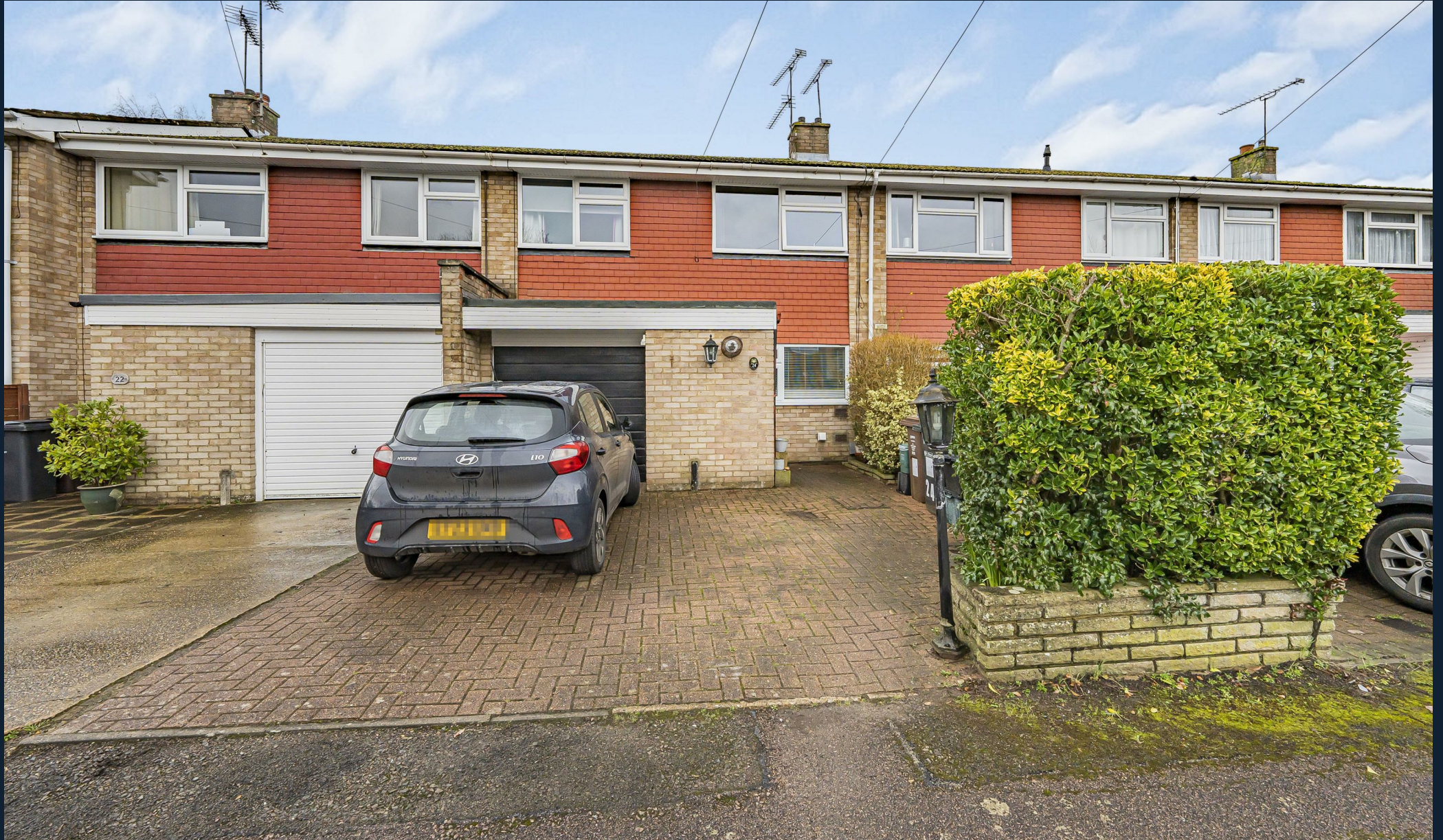
24 WOOD END, PARK STREET, ST. ALBANS, AL2 2RX GUIDE PRICE £480,000