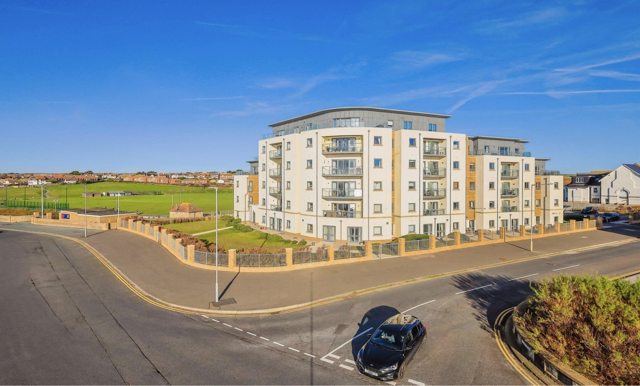
Eversley Court Dane Road, Seaford BN25 1FF