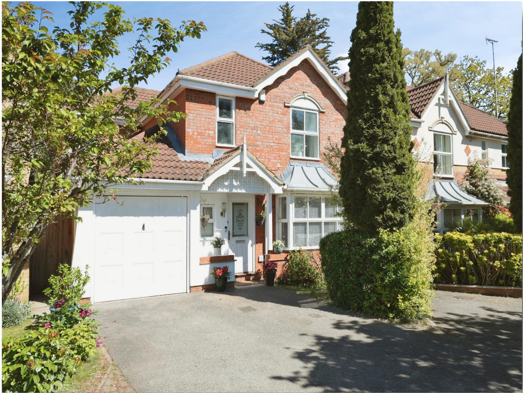
Wellington Close, Watford, WD19 5BF