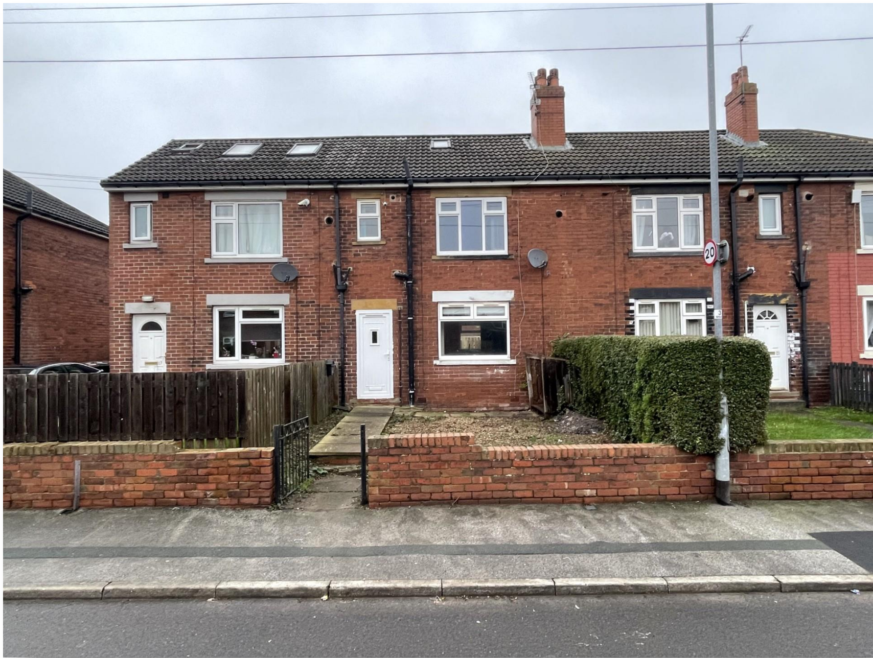
Moorland Avenue, Gildersome Leeds LS27 7BY