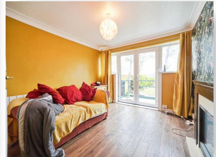
Brookfield Court, Leeds LS13 1ND