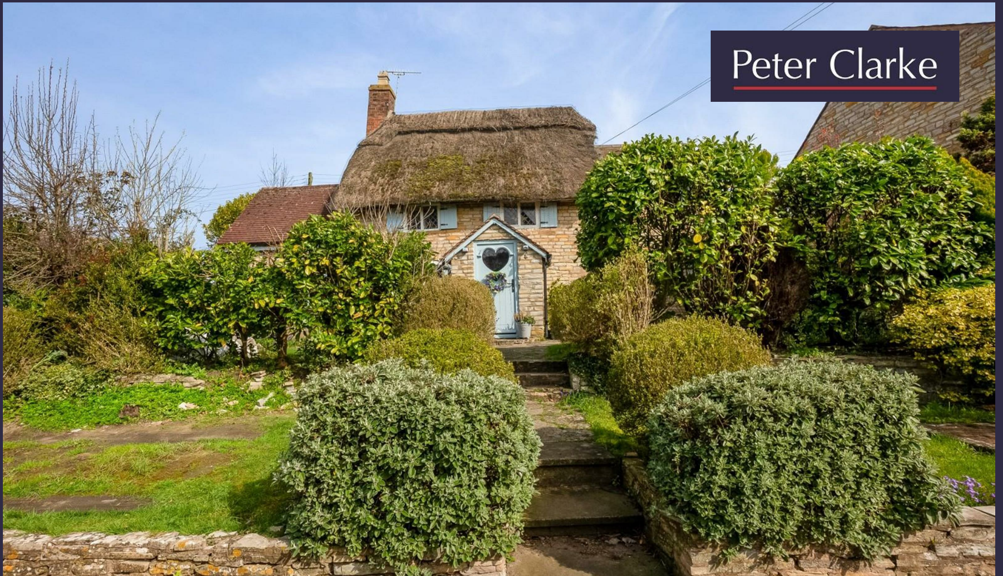
Little Dene Cottage, 170 Binton, Stratford-upon-Avon, CV37 9TW