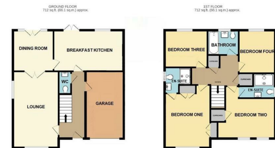
TOTAL FLOOR AREA: 1424 sq ft (132.2 sq m) approx. Measurements are approximate. They are not intended to be used for legal purposes only.

These particulars are believed to be accurate but they are not guaranteed and do not form a contract. Neither Jordan Fishwick nor the vendor or lessor accept any responsibility in respect of these particulars, which are not intended to be statements or representations of fact and any intending purchaser or lessee must satisfy himself by inspection or otherwise as to the correctness of each of the statements contained in these particulars. Any floorplans on this brochure are for illustrative purposes only and are not necessarily to scale