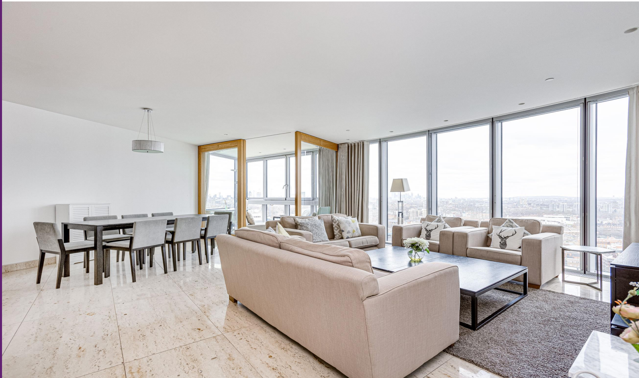
The Tower 1 St. George Wharf, SW8