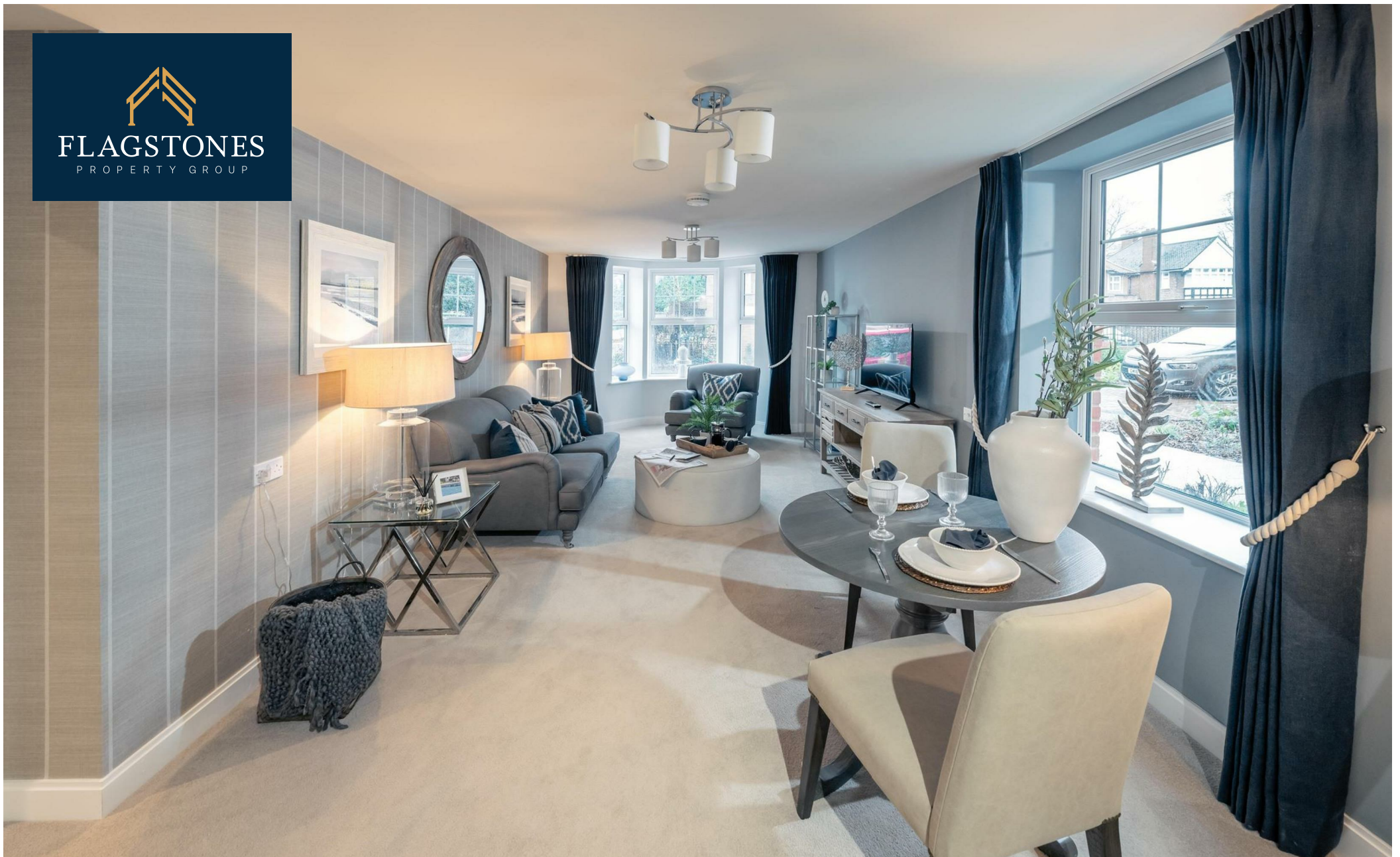
Apartment 4, Eastry Place 35-41 New Dover Road, Canterbury, CT1 3AT £399,000