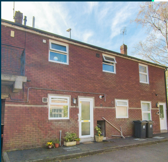
Tandridge Court, Darlington, DL3