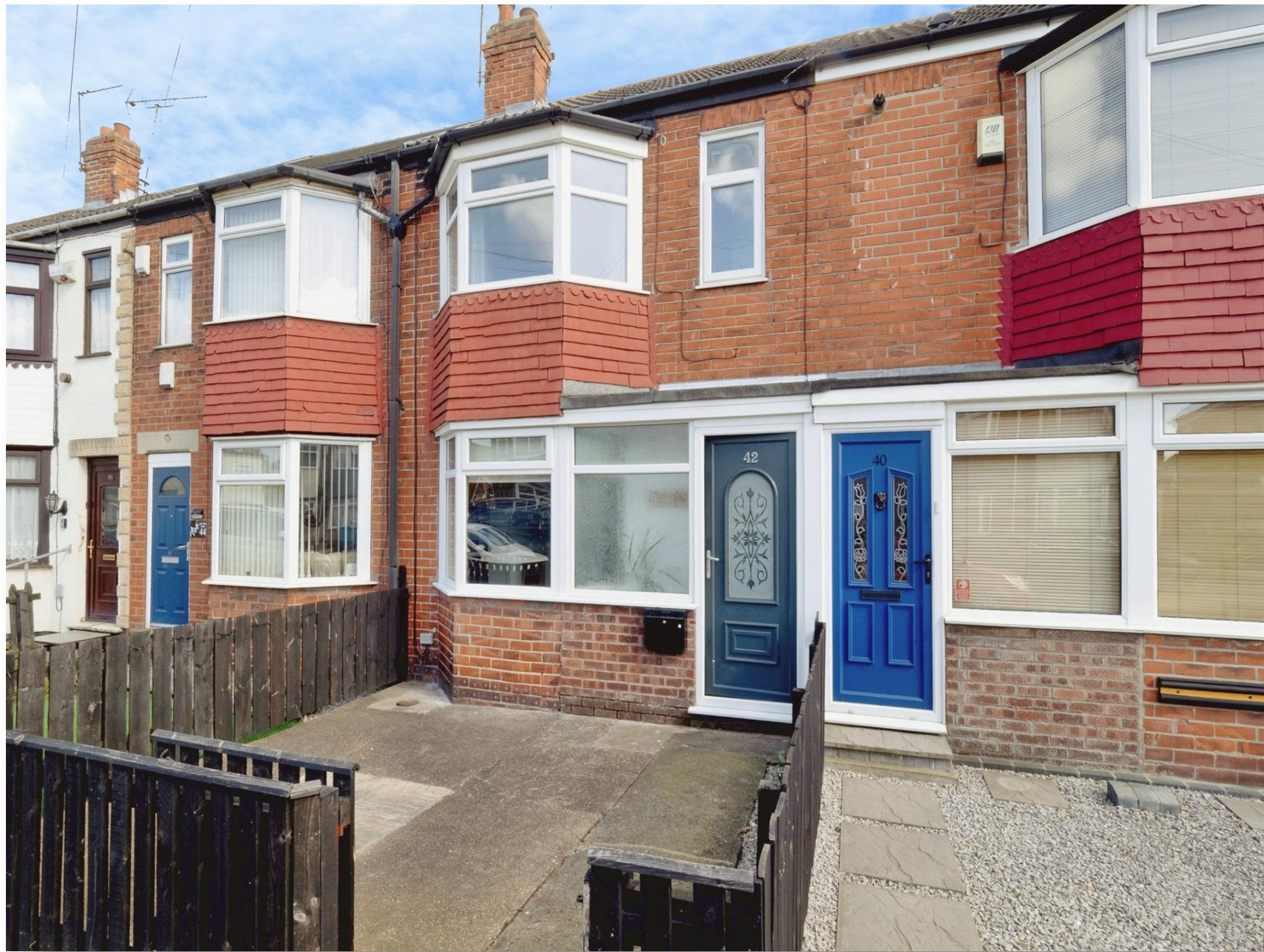
Lamorna Avenue, Hull, HU8 8HR