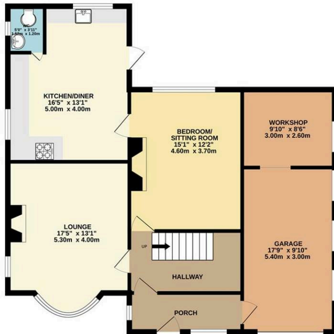
GROUND FLOOR 970 sq.ft. (90.1 sq.m.) approx.