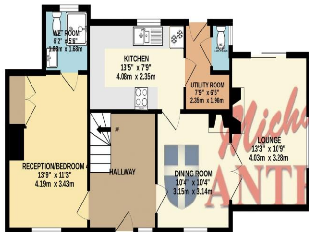
GROUND FLOOR 670 sq.ft. (62.2 sq.m.) approx.