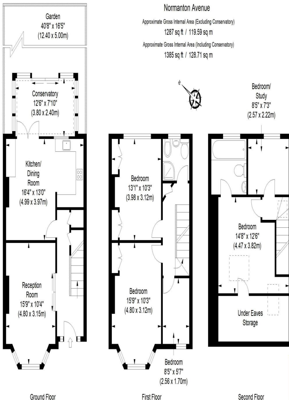
ILLUSTRATION FOR IDENTIFICATION PURPOSES ONLY

ALL MEASUREMENTS ARE MAXIMUM, AND INCLUDE WINDOW BAYS AND WARDROBES WHERE APPLICABLE THIS PLAN MUST NOT BE REPRODUCED BY ANY OTHER PERSON WITHOUT PERMISSION