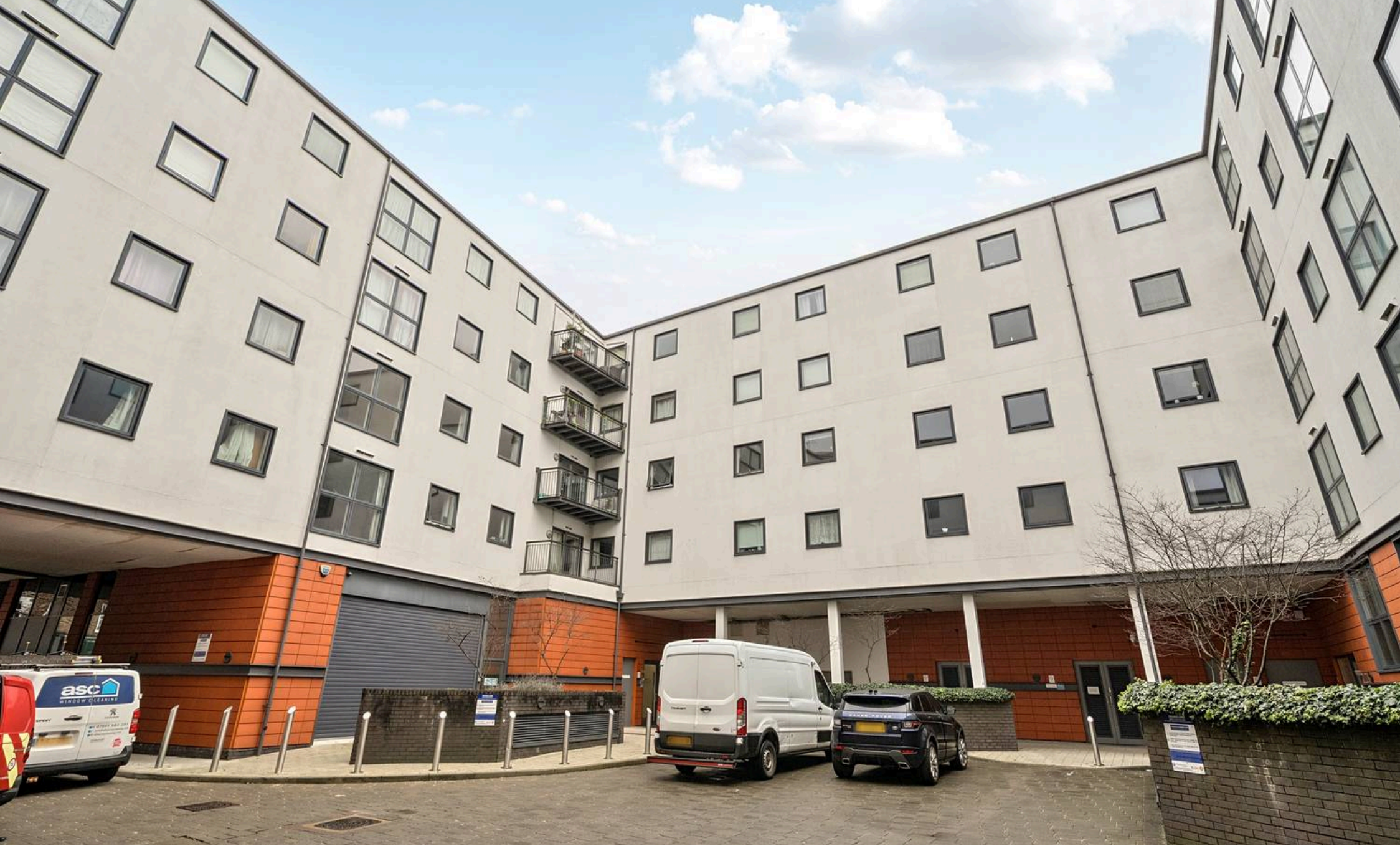
Capitol Square 4-6 Church Street, Epsom