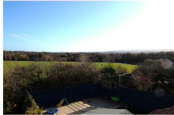
Views from Bedroom 2