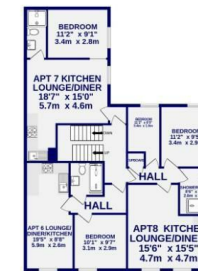
3RD FLOOR 826 sq.ft. (76.8 sq.m.) approx.