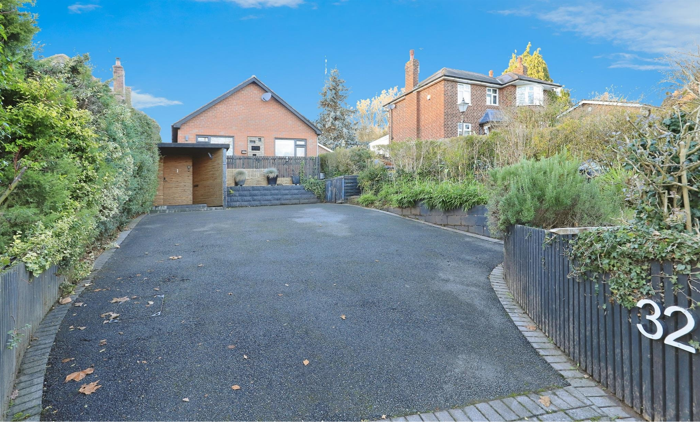
Chester Road South, Kidderminster DY10 1XJ