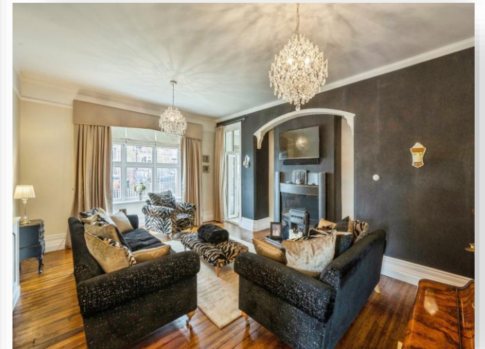
Heydon House Buckingham Road, Conisbrough Doncaster DN12 3DE