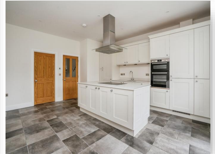
Crescent Road, Gosport, PO12 2DJ