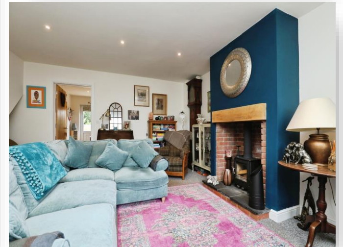
Ambleside, Swaffham, PE37 8HL